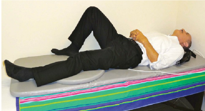
My wife, I, and many of my patients have come to make PEMF therapy a regular part of our wellness routine.